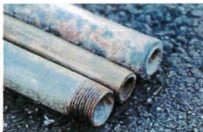
(L-R) Galvanized, Copper, Lead Pipe

*Note: A magnet will stick to Galvanized Steel pipe